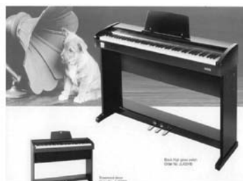
Now Only $1,099 Benches from $55

German Designed Digital Pianos for Today's Young Pianists