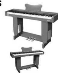
First Step & First Love