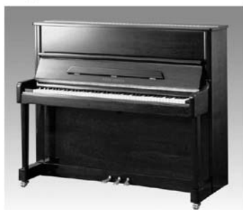
NA 116E Now Only $2,919

European Style Pianos by Toyo, JAPAN Buy Direct From the Importer